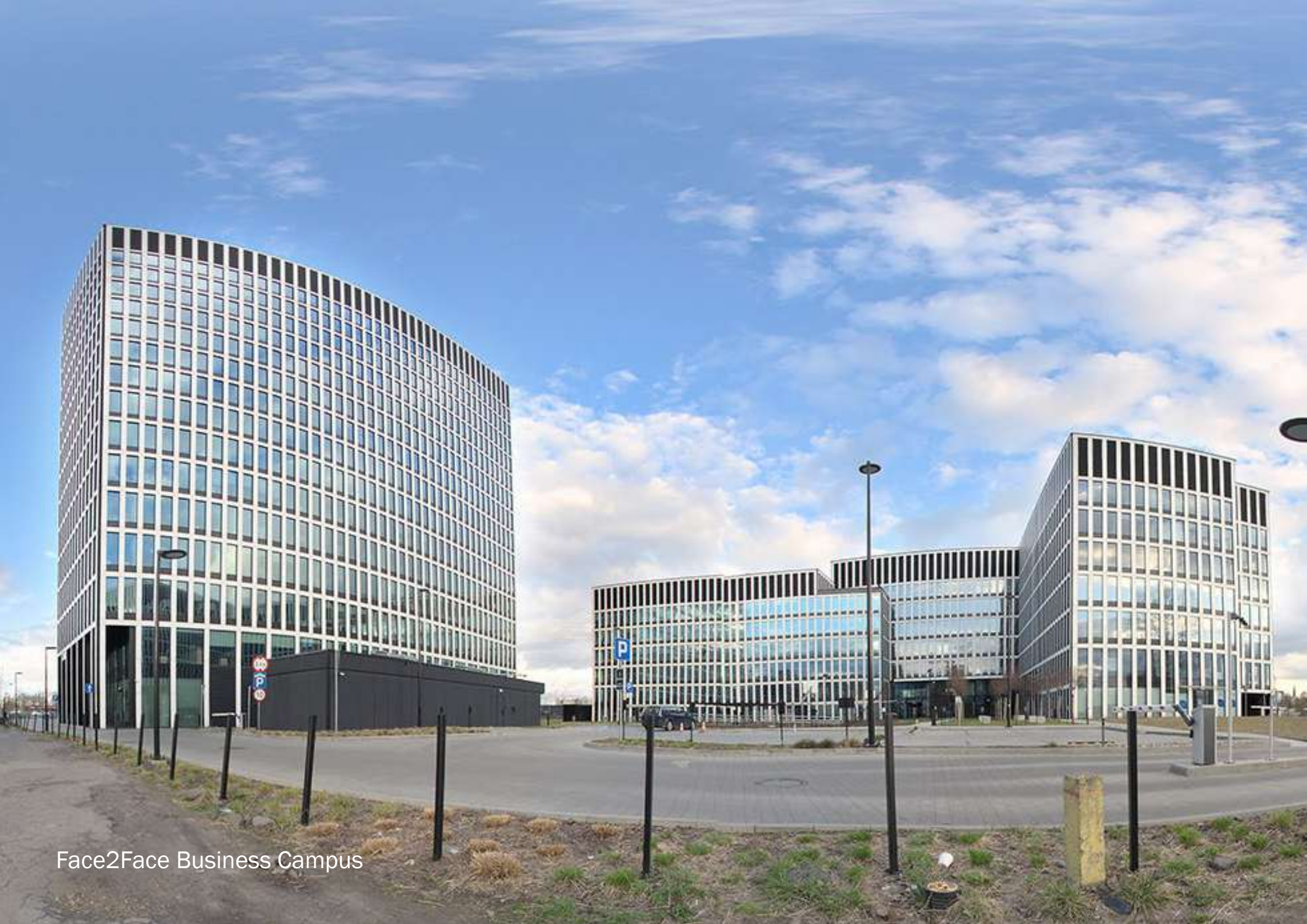
Face2Face Business Campus