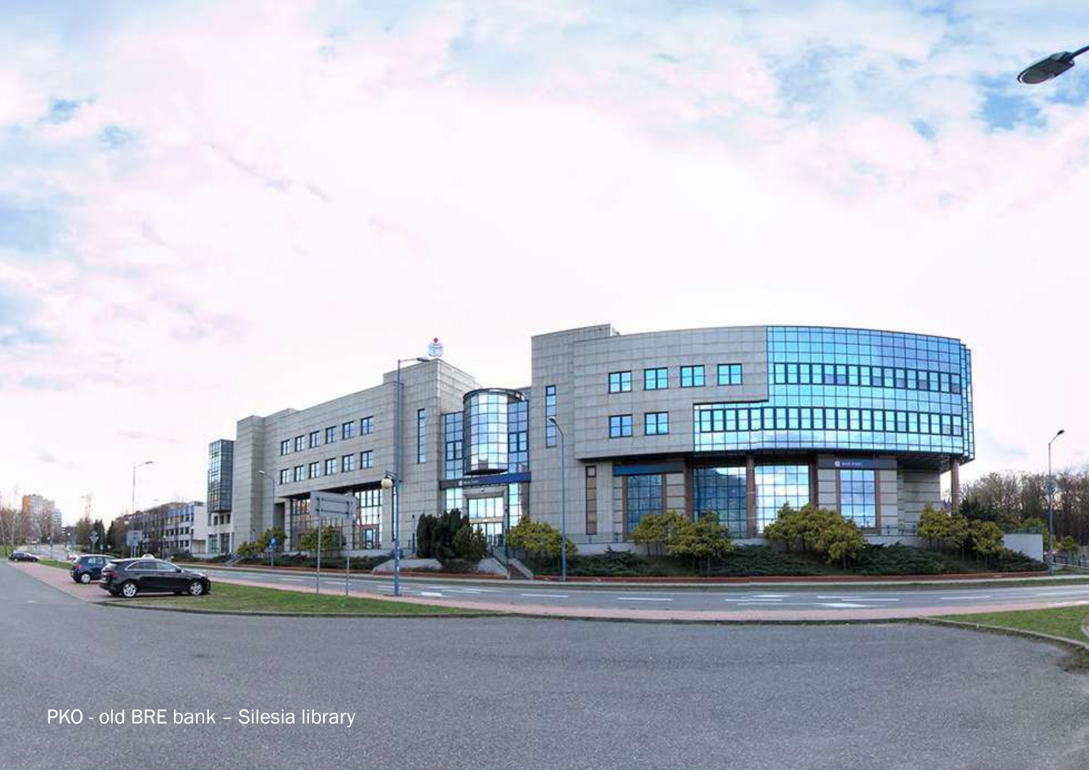
PKO - old BRE bank – Silesia library