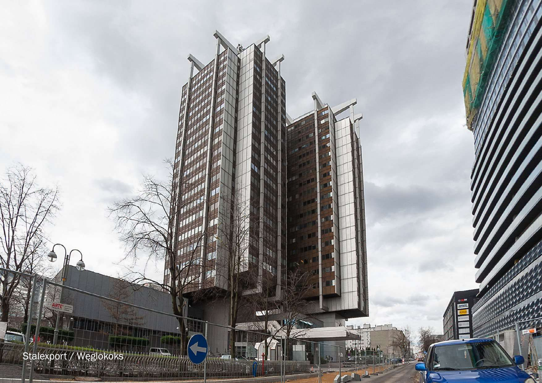
Stalexport / Węłokoks