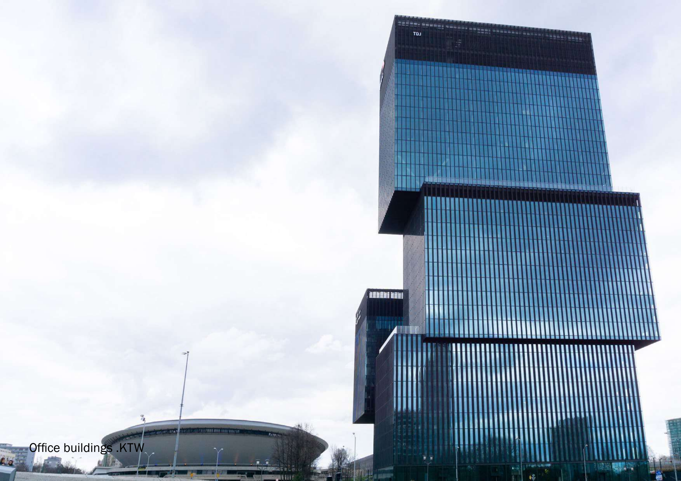
Office buildings .KTW