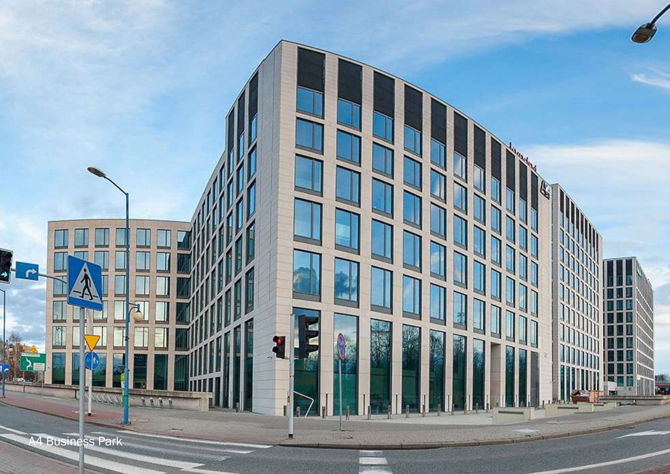
A4 Business Park