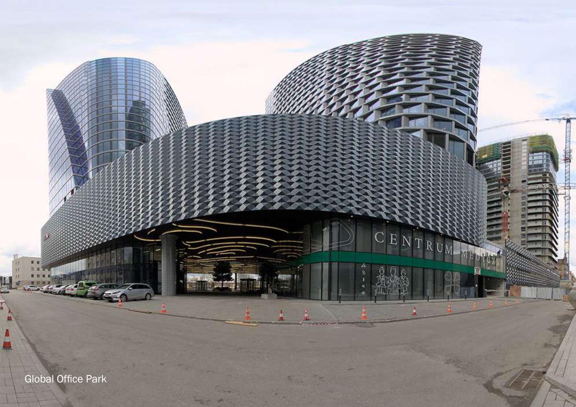
Global Office Park