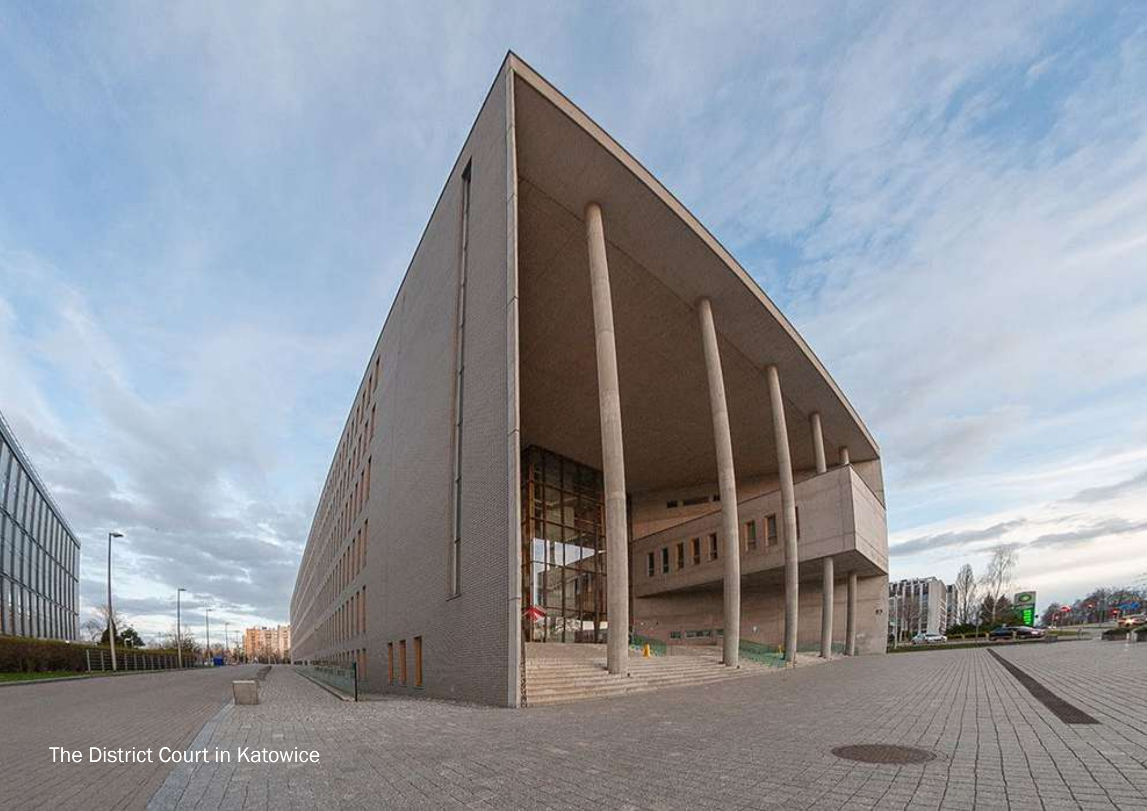
The District Court in Katowice