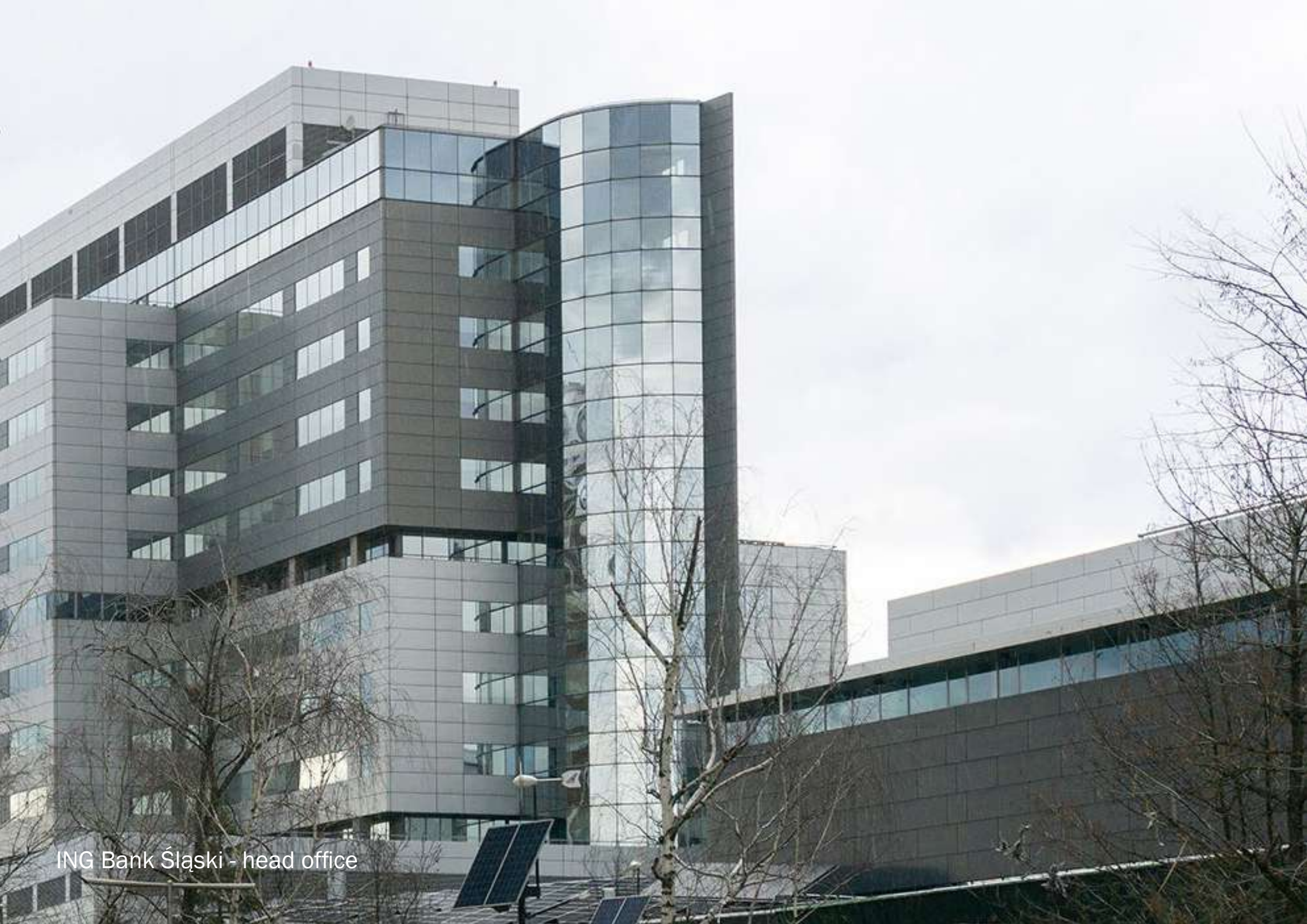
ING Bank Śląski - head office