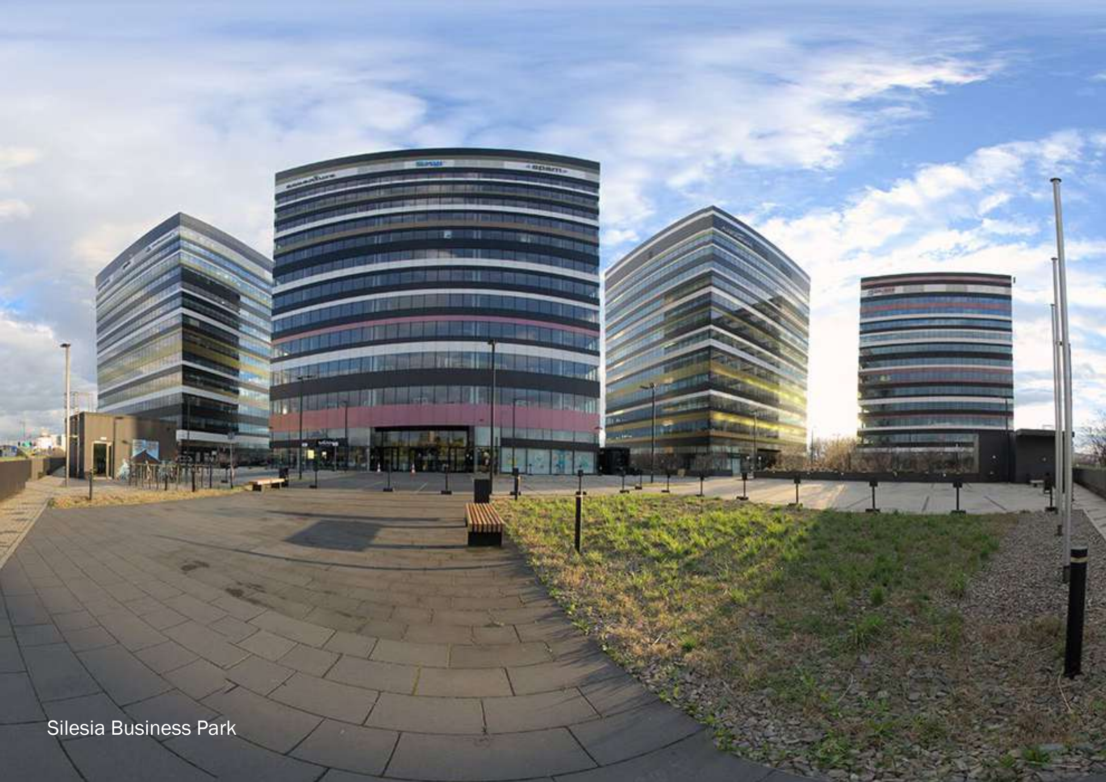
Silesia Business Park